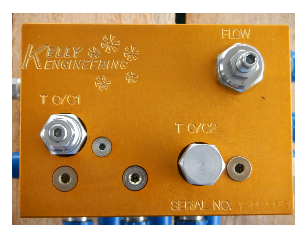
Manifold with valve removed and plug installed in orifice T O/C2

Please ensure the valve cartridge that is removed, part # CBCL-LJN, is kept clean and sealed in a zip lock bag. At the suppliers cost these will be returned to the supplier.